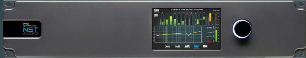
The System Tech's Toolbox.

Perfect for FOH duties as a highly capable System Manager and Console Switcher. Matrix and Routing, Speaker Management and Format Conversion. Simultaneous 16 Dante, 8 Analogue, 8 AES3 IO, Grouping & EQ Layers.